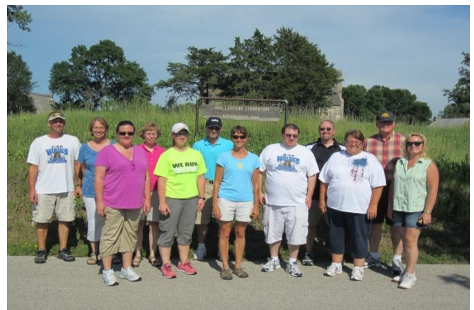
Summer 2012 GAI workshop participants at the Iowa Lakeside Laboratory near Okoboji

Besides the fact that many of the “Stars” workshops will be delivered on-line and led by our outstanding GAI TCs, the other real strength of this program is that it focuses on how best to teach geography rather than just geography content. Award-winning teachers in Texas and Michigan are the central focus on these modules and each one includes actual footage of classroom implementation and a discussion of the teachers’ teaching techniques by experts in the field. In addition, each module includes professionally-produced video and print materials that provide the background and context for each topic. “Teaching With the Stars” promises to be a key part of GAI programming in the next few years and we are pleased to finally be able to offer you some on-line workshops, something that many GAI members have been requesting for some time. I’ll provide more information on these workshops in the Spring, but for now you can take a close look at “Stars” content at the following website: http://www.geoteach.org/