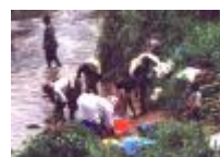
Washing clothes and children in Ibadan.

Washing clothes and bathing children down river from the sight where the men are washing the barrels.