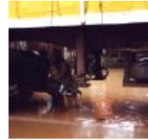
Waiting for the rain to stop in the Onitsha market place.