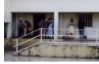
When it rains - you wait.