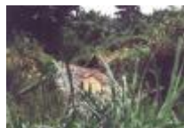
River in Ibadan