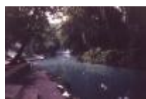
Yankari hot springs