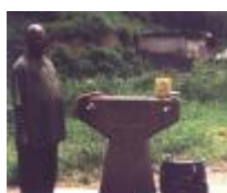
Well located by the river.