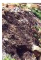
Six weeks of garbage